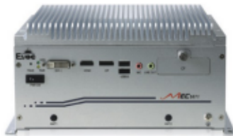
( Dual-expansion )

Intel 4th-generation Core High-performance Fanless Embedded Computer