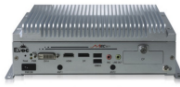
( Ultra-slim )