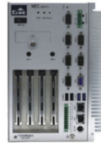
( Quad-expansion )