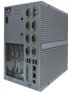
( Quad-expansion )