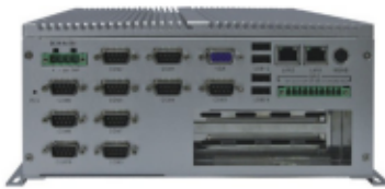
( Dual-expansion )

Low-power Fanless High-performance Embedded Computer