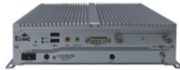
( Ultra-slim )